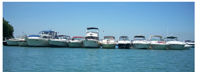
Not bad for the first GLSBC gathering at Barge Bay!!